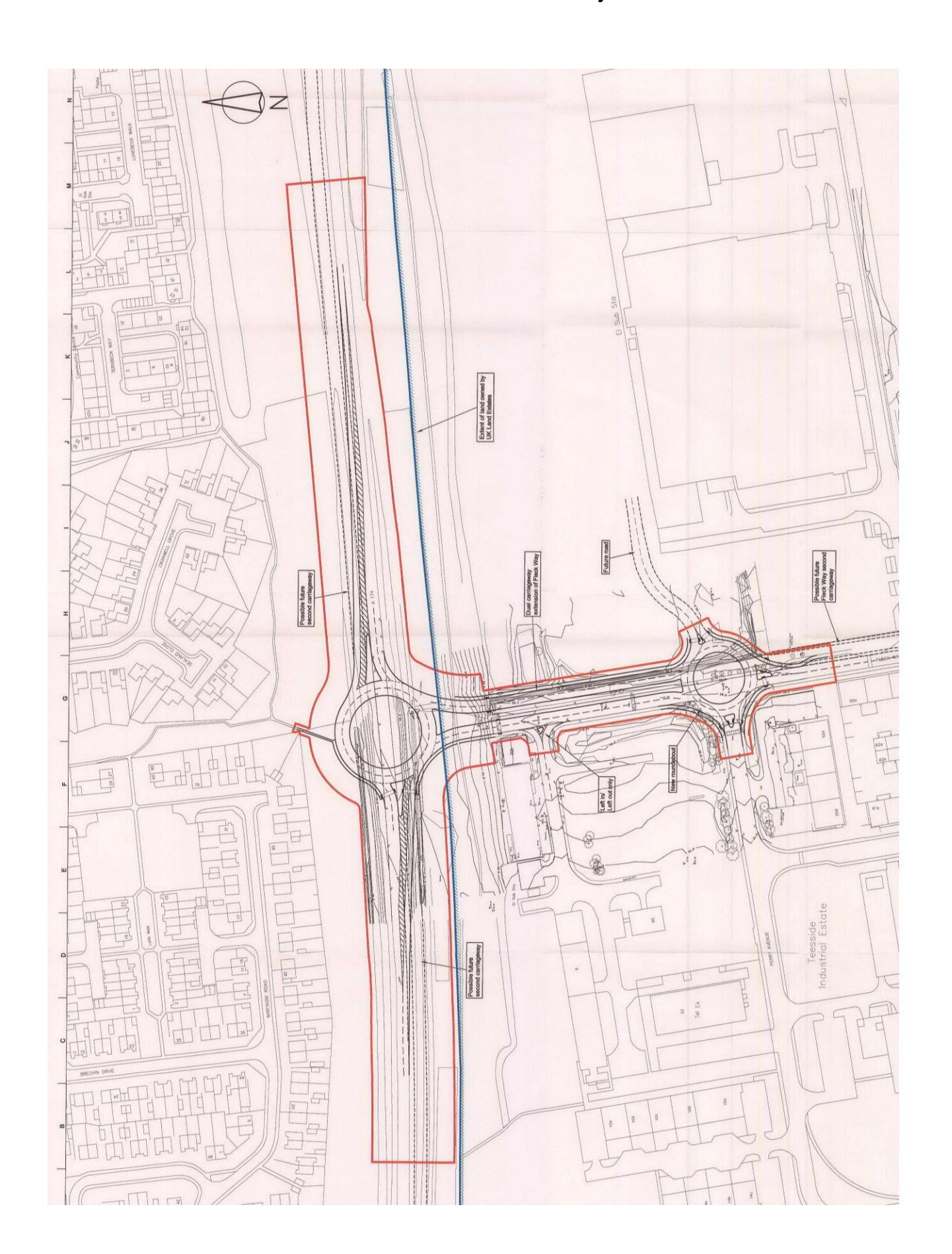
10/2833/RNW - Appendix. Ref. 1 Site Layout Plan New roundabout junction and access on the A174